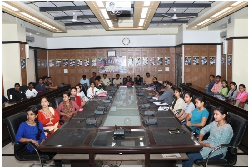
Manas Pushpa VyakhyanMala