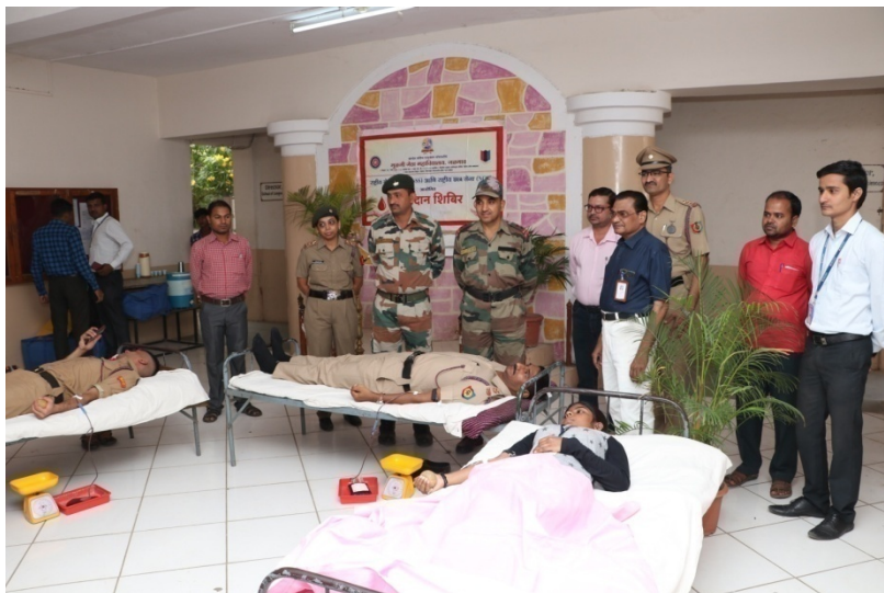
Blood Donation Camp Organizing by NSS and NCC Dept.