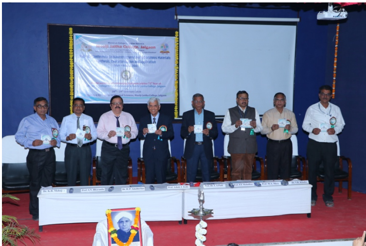
National Conference on Nanostructured and amorphous materials