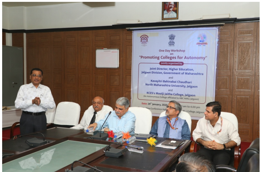
“Promoting Colleges for Autonomy” Workshop