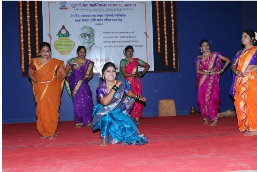
Marathi Bhasha Gaurav Din Cultural Program