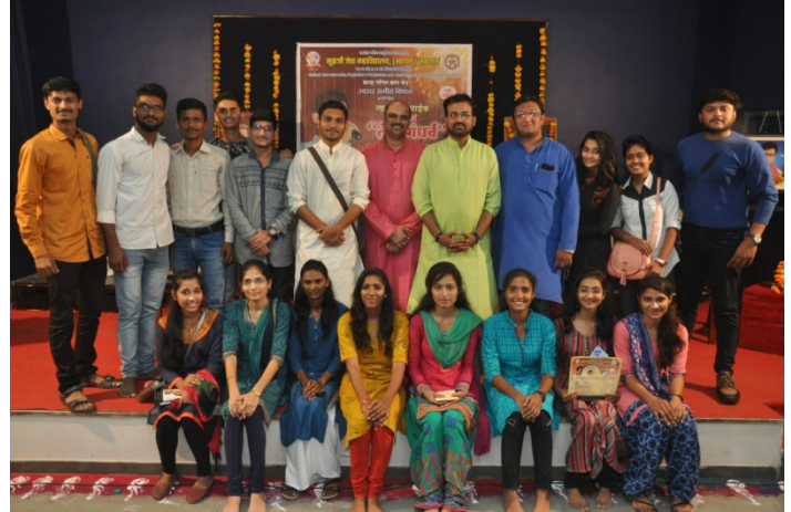
National Level Classical Music Competition