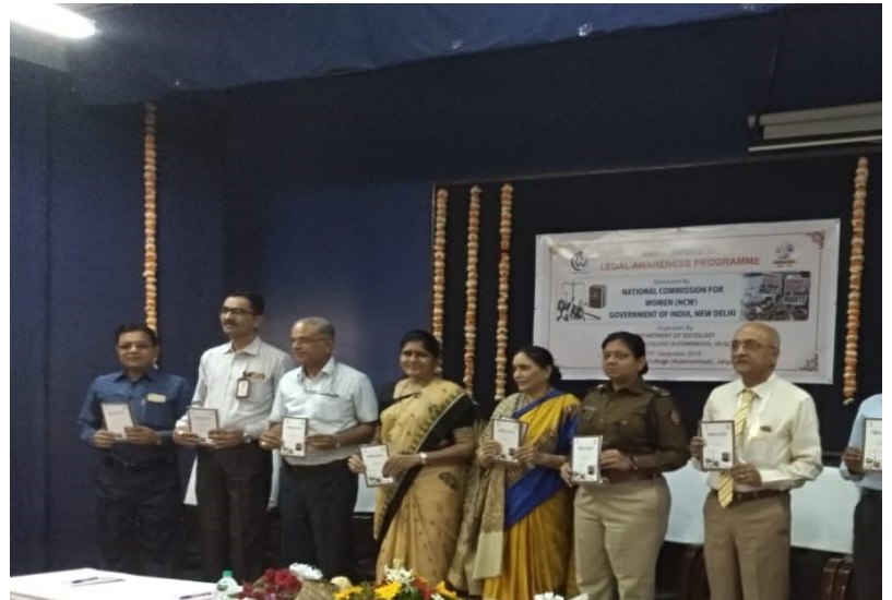
One day workshop, legal awareness programme