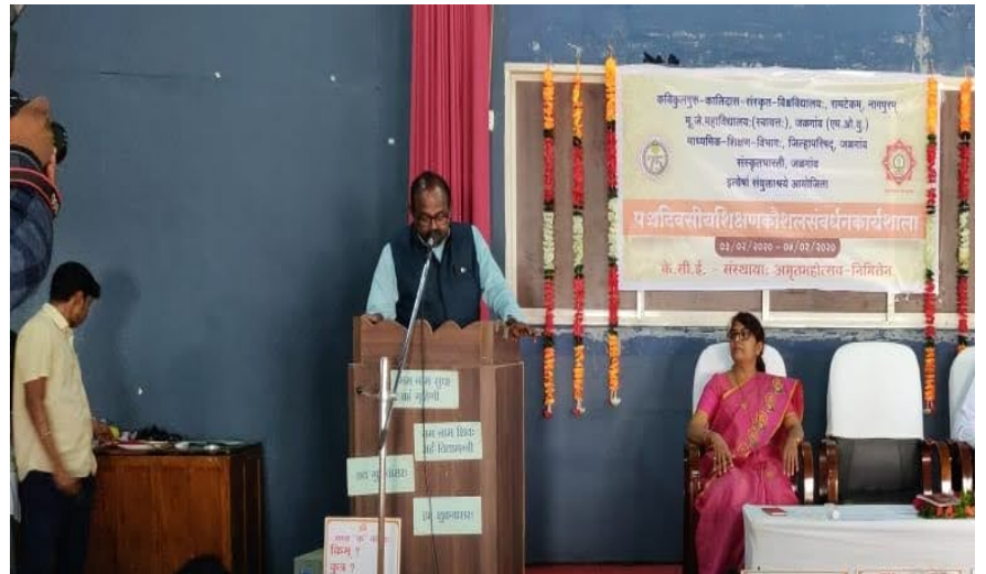
Shikshan Kaushalya Samvardhan Karyashala