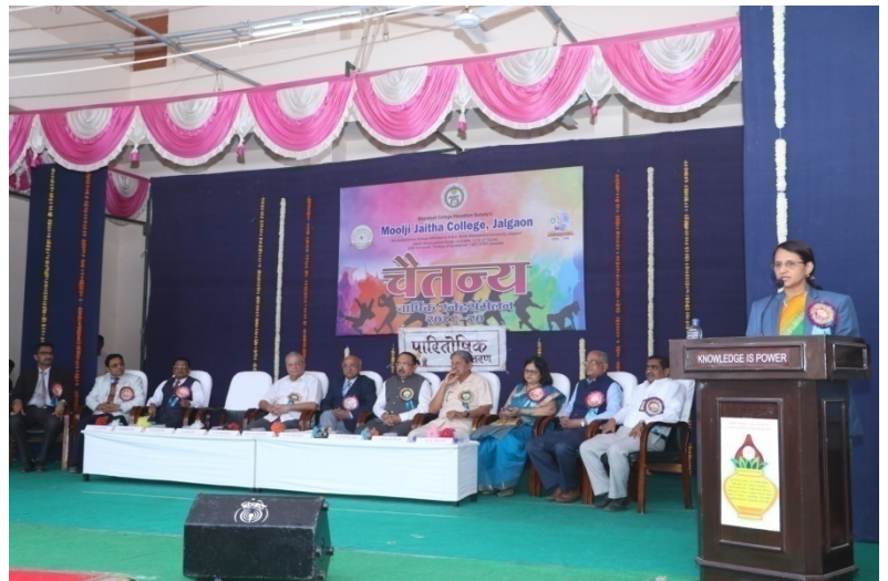
Chaitanya 2020 College Annual Function Prize Distribution Ceremony