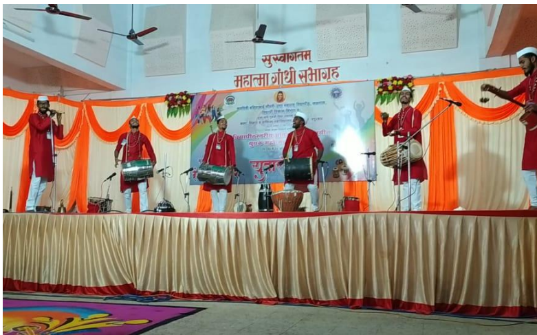
Inter Collegiate Yuvarang Youth Festival Folk Orchestra Performing our College Students