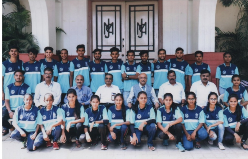
आंतरमहाविद्यालयीन फुटबॉल स्पर्धा 2019-20 पुरुष व महिला (विजेता) संघ